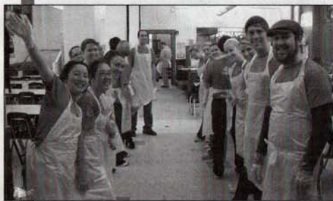
LoopNet employees arrange an assembly line to prepare meals at Glide Memorial Church.

The organization's Desert branch provides youth care, family and emergency care, and health care for Coachella Valley and Morongo Basin residents. ▀