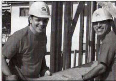
LoopNet employees throw on their hard hats as they assist Habitat for Humanity of San Gabriel.

In the Southern California region, employees worked with Earthworks, an organic farm run by the Los Angeles Conservation Corps that provides learning opportunities for at-risk youth.